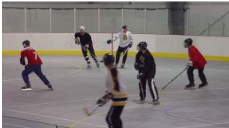
Summer roller hockey, June 2003

Submit pictures or a short update on activities in your community to Dave Lewis at: dave_lewis@ci.juneau.ak.us