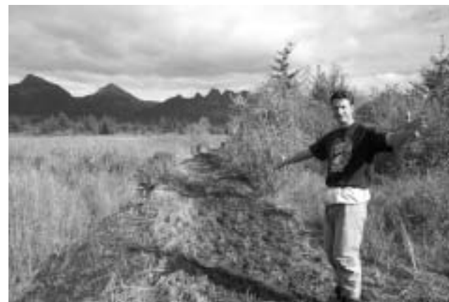
This is a section of the Alaganik Fisherman's Trail before trail construction showing severe damage to the muskeg.