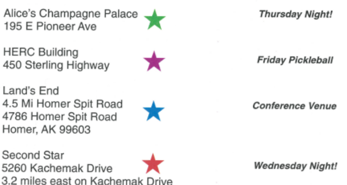
Welcome to Homer!